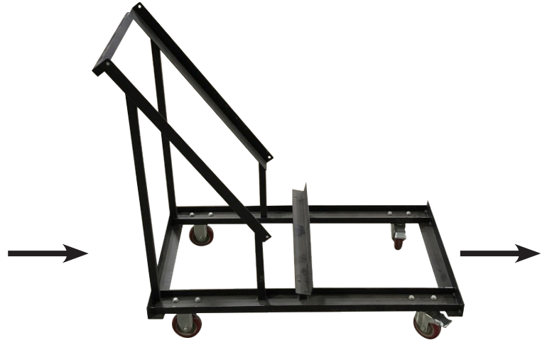
4-LEG CHAIR DOLLY (350101AM0H)

MAXIMUM LOADING: 16 (UPHOLSTERED or NON-UPHOLSTERED)