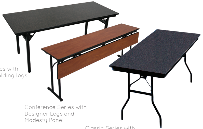
600 Series with square folding legs

PS Furniture's laminate folding tables offer a versatile solution for meeting room space. Made with a rugged plywood core, patented corners and a variety of leg styles to choose from. Like all PS Furniture products, our laminate folding tables are made to be easily moved, stacked and stored.