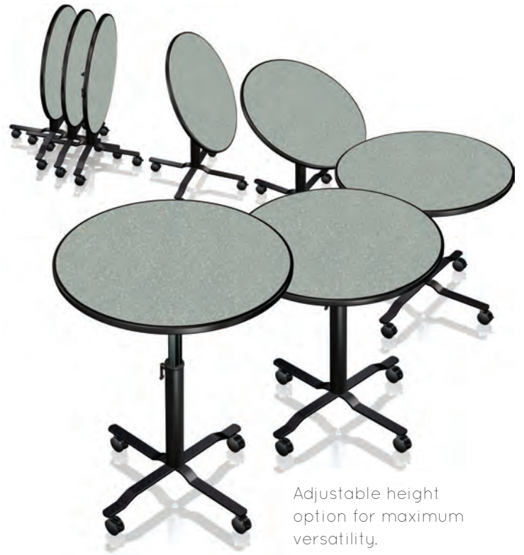
Adjustable height option for maximum versatility.

Rollers™ can be easily moved for different layouts, set to different heights and nested for storage, all with stunning convenience. And all Rollers™ portable tables feature MAXX Edge® for amazing, seamless durability.